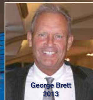
George Brett 2013