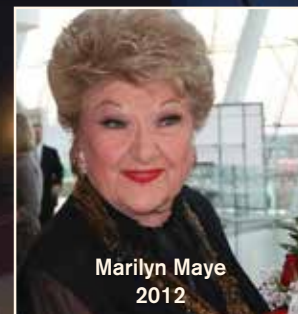
Marilyn Maye 2012