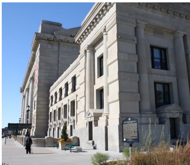
At left (looking west) is Union Station with our marker in the foreground, taken after the Ceremony concluded.