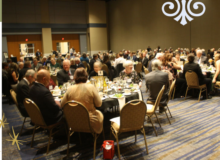
A wonderful Dinner was served at 7:15 to all attendees as pictured above.