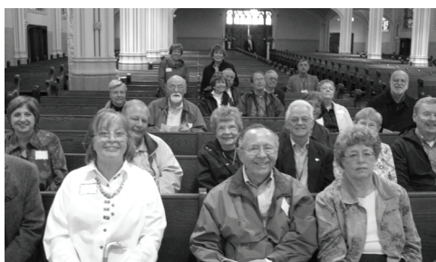
The tour group at Redemptorist