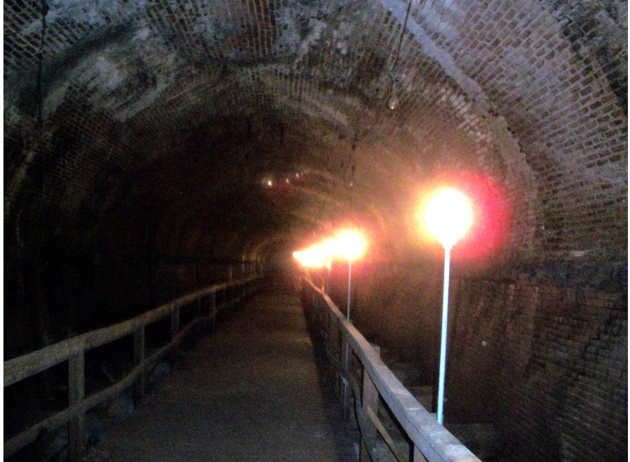
March 24 Tour of Titanic Exhibition

The Native Sons and Daughters of Greater Kansas City will tour the exhibit on March 24th, 1:30 p.m. with an optional lunch at 11:30 at Harvey's in Union Station. Reservation notices will be sent in February. Guests are welcome, and you may pay online at www.nsdkc.org. The reservation deadline is March 5.