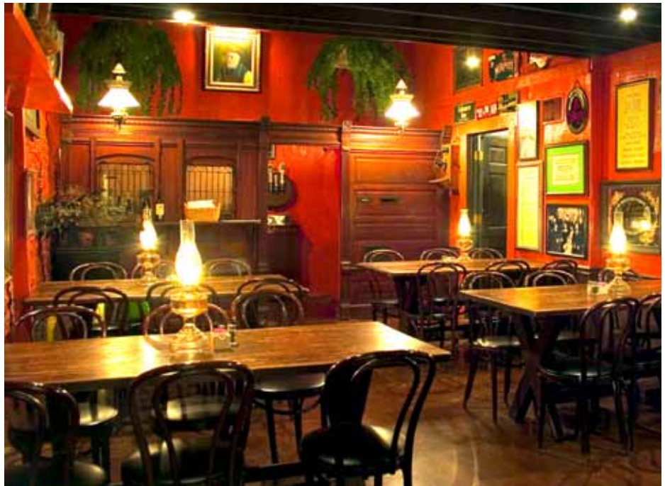
The dining room at O'Malley's 1842 Pub, in historic Weston, Missouri