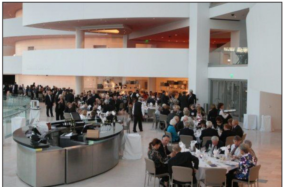
Kauffman Center for the Performing Arts, venue for the 2012 Outstanding Kansas Citian

My best to you and your organization. Keep it Happening!"