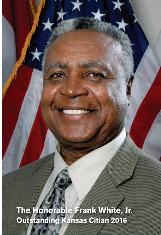
The Honorable Frank White, Jr. Outstanding Kansas Citian 2016

Frank White grew up in the shadow of Municipal Stadium then played for the Royals for 18 years. As a civic leader and Jackson County Executive, he continues to be a role model for Kansas City.