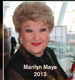
Marilyn Maye 2012