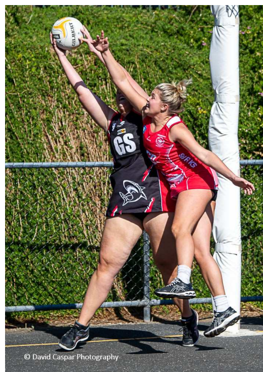
B Grade Action