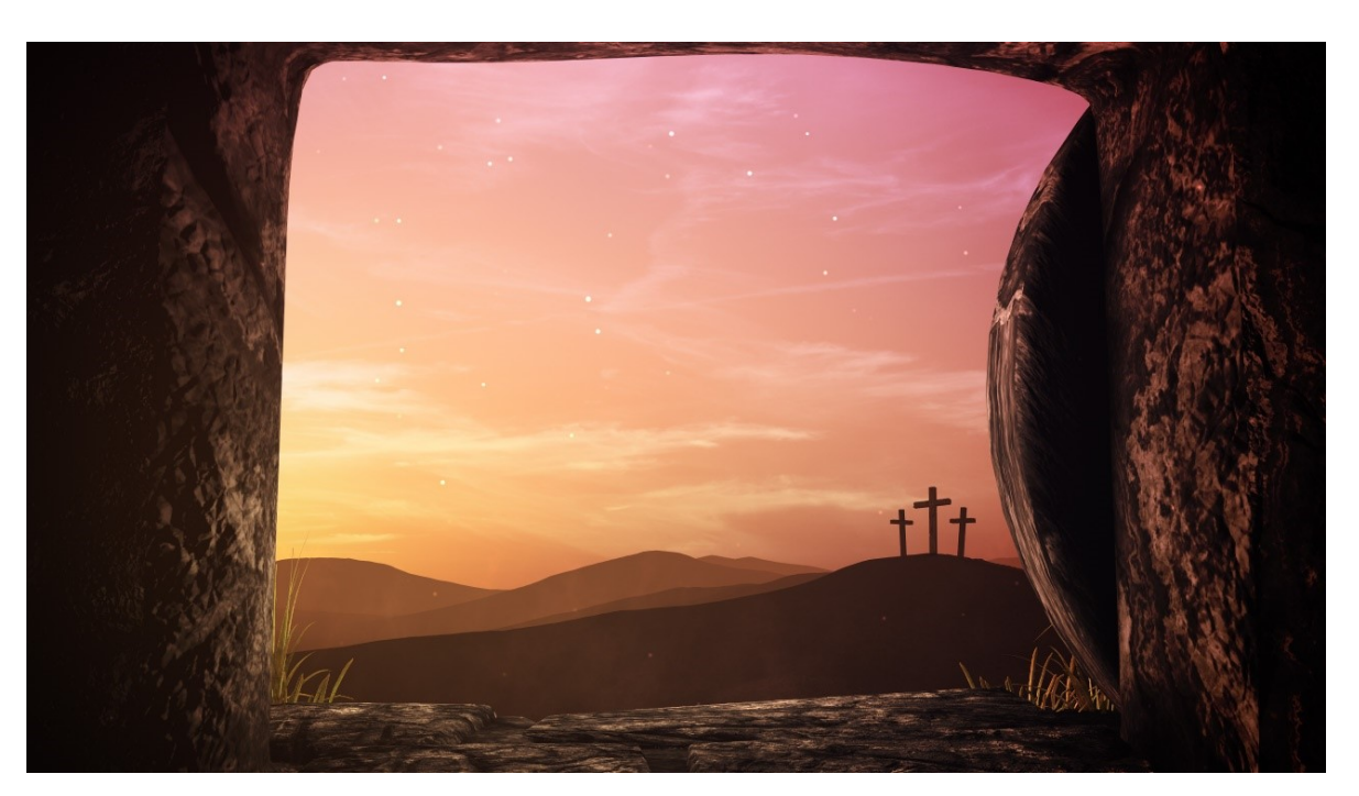
Easter is Sunday, March 31.

-We will be having noisy offering so bring your loose change. Proceeds go to activities and snacks for our after school program.