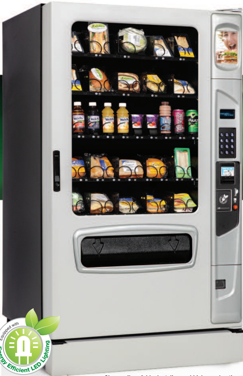
Shown silver & black styling and kick panel options.

The Alpine 5000 Elevator is the latest version of USI's class leading glass front food & beverage merchandiser and is designed to gently serve a wider variety of prepackaged meals, sandwiches, salads, dairy, fresh fruit & beverages.