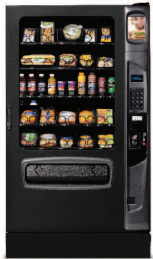
Shown in black with motor pairing and kick panel options.