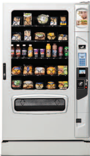
Shown in silver with optional iCart interface & kick panel.