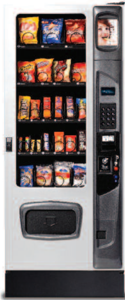
Shown with optional ADA door, custom door color & kick panel.