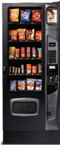
Shown with optional ADA door, iCart touch screen & kick panel.