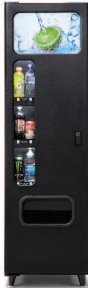
Summit 300 Satellite