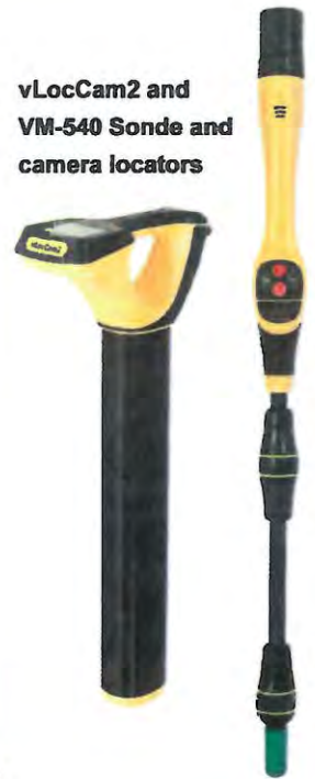
vLocCam2 and VM-540 Sonde and camera locators