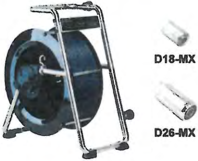
Mini Reel and Cameras