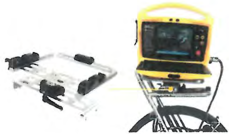
Rotate and Tilt Mounting Table