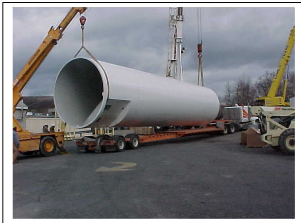
Two crane pick of silo prior to setting on concrete pad.