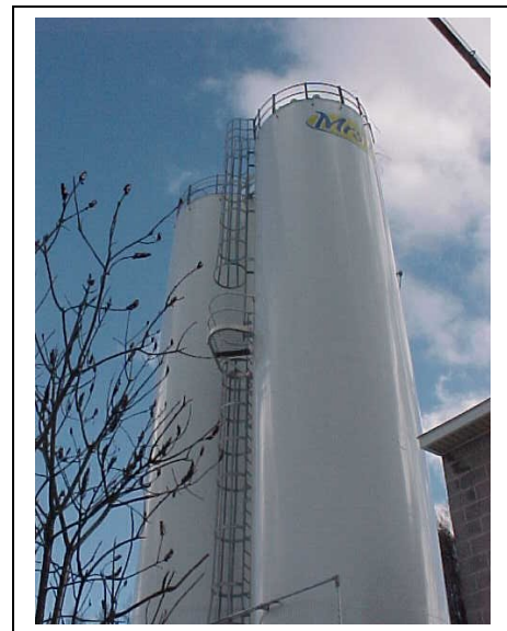
Overall view of bulk flour silos after installation