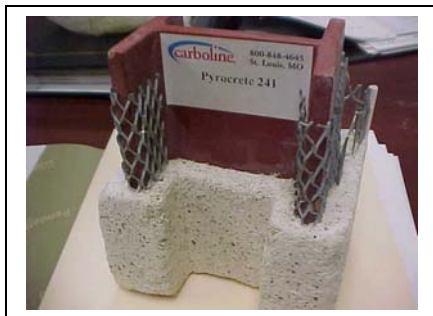
Typical detail of structural steel fire proofing