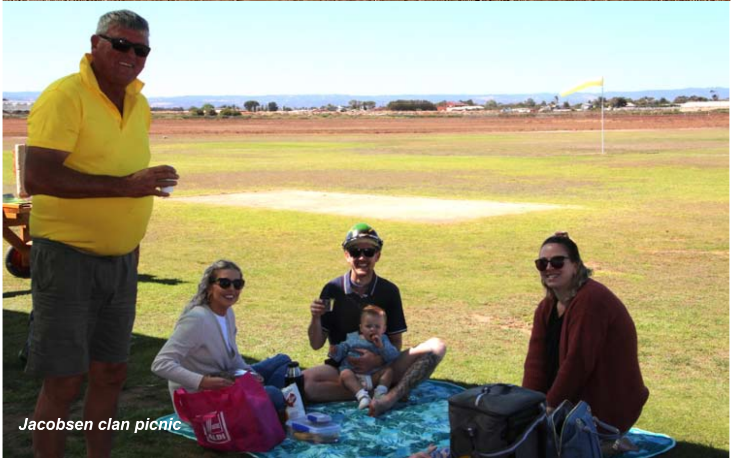
Jacobsen clan picnic