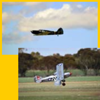
Scale Aircraft Society of South Australia