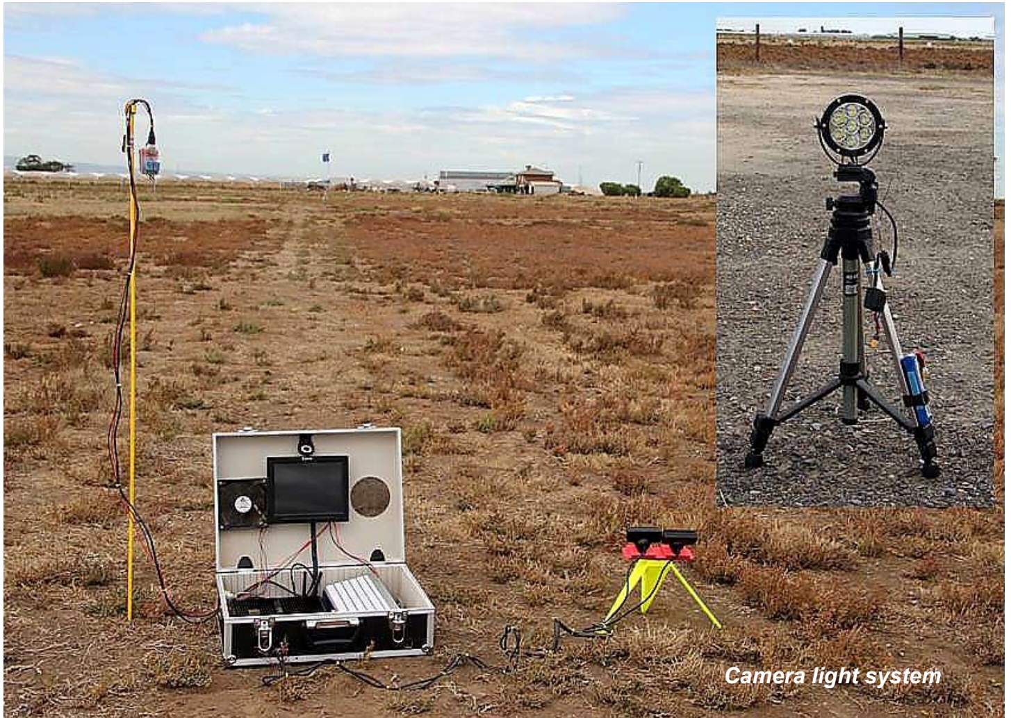
Camera light system