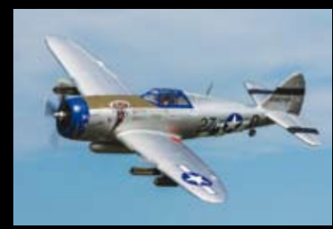
P-47 Razorback 1.2m