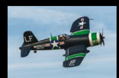
F4U-4 Corsair 1.2m