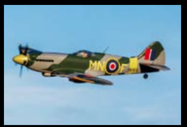
Spitfire Mk XIV 1.2m

© 2019 Horizon Hobby, LLC. E-flite, AS3X, SAFE, and the Horizon Hobby logo are registered trademarks of Horizon Hobby, LLC. The Spektrum trademark is used with permission of Bachmann Industries, Inc. All other trademarks, service marks, or logos are property of their respective owners. 62783