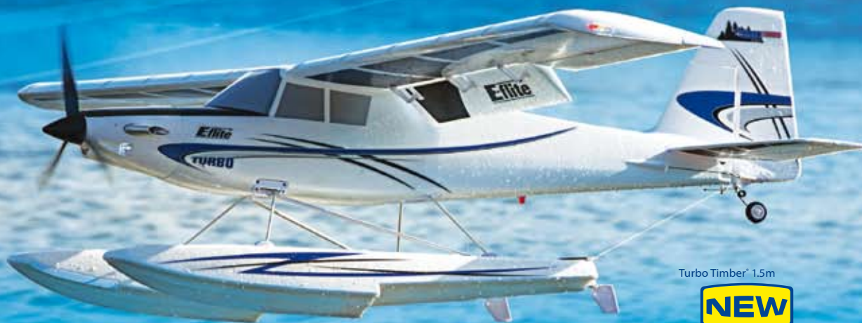
Turbo Timber® 1.5m

– Glassman, HorizonHobby.com customer review