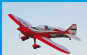
Commander mPd® 1.4m