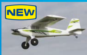
Timber® X 1.2m

From ultra-slow flight and STOL capabilities to outrageous 3D aerobatics and wildly fast racers, flying wings and beyond, E-flite® sport airplanes feature industry-leading designs and advanced capabilities. Add to that the advantages of exclusive Spektrum™ AS3X® and SAFE® Select technologies and you've got unmatched flight performance that both new and long-time pilots will appreciate and enjoy. Fly one today to experience the difference that outdoes all the others.