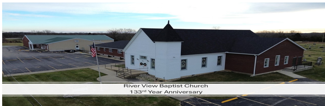
River View Baptist Church 133rd Year Anniversary

Sunday October 13, 2024 -We are celebrating 133 years of ministry!