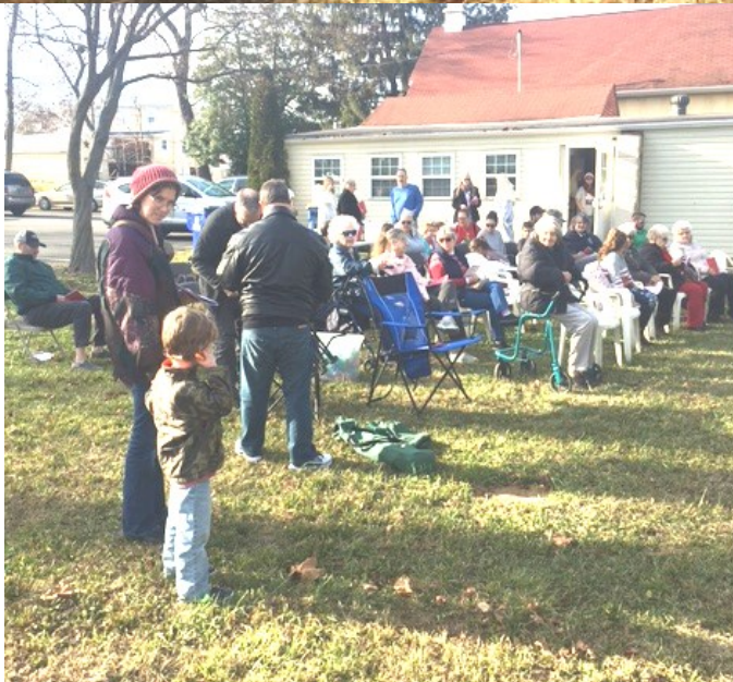
Left—Audience participating in singing carols and watching program.