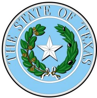
GREG ABBOTT, GOVERNOR OF TEXAS