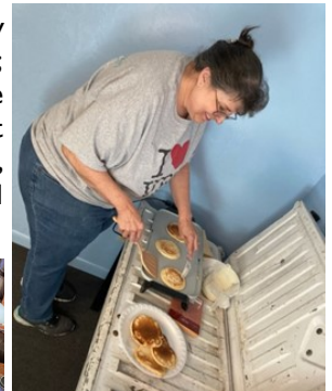
Never thought I would be cooking pancakes on a tailgate.