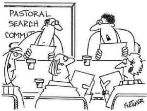
"Basically, we're looking for an innovative pastor with a fresh vision who will inspire our church to remain exactly the same."

Church council will meet at 5:00, August 9, followed by the business meeting at 6:00.