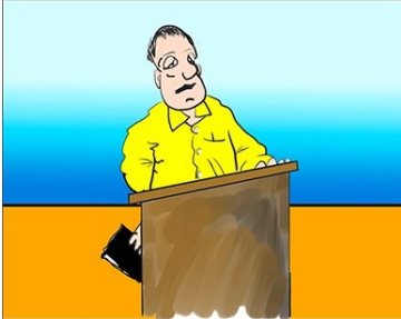
When the sign said "If you park here, you preach today!" I thought it was a joke...

Church council will meet at 5:00, July 12, followed by the business meeting at 6:00.