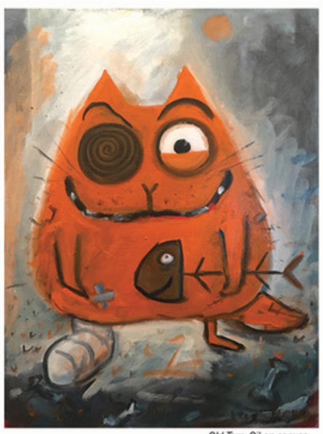
Old Tom, Oil on canvas