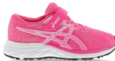
PRE EXCITE 7 PS Junior $89 99