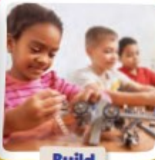
Build a Bot