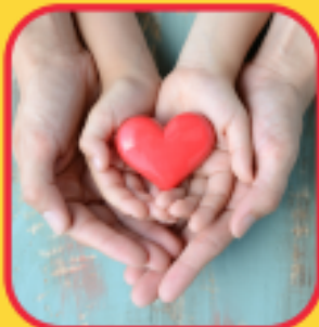
Resources & Support for Families

Resources, education & fun for the whole family