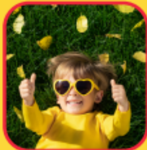
Fun Activities for all Ages & Abilities