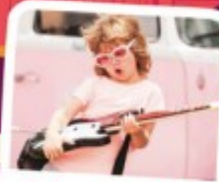
School of Rock