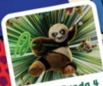
Kung Fu Panda 4