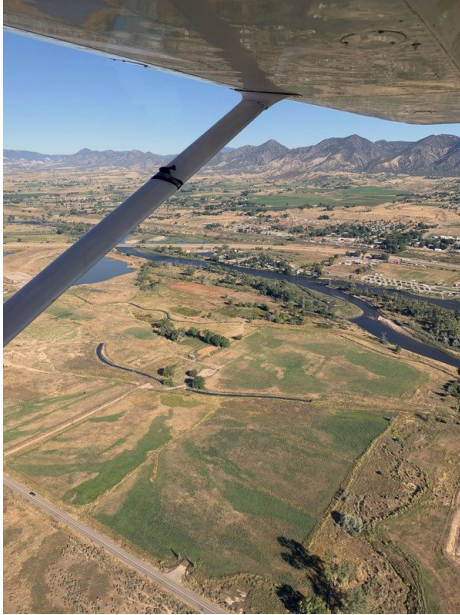
Photo Point - 1 View NNW over property. (39.532305, -107.659464)