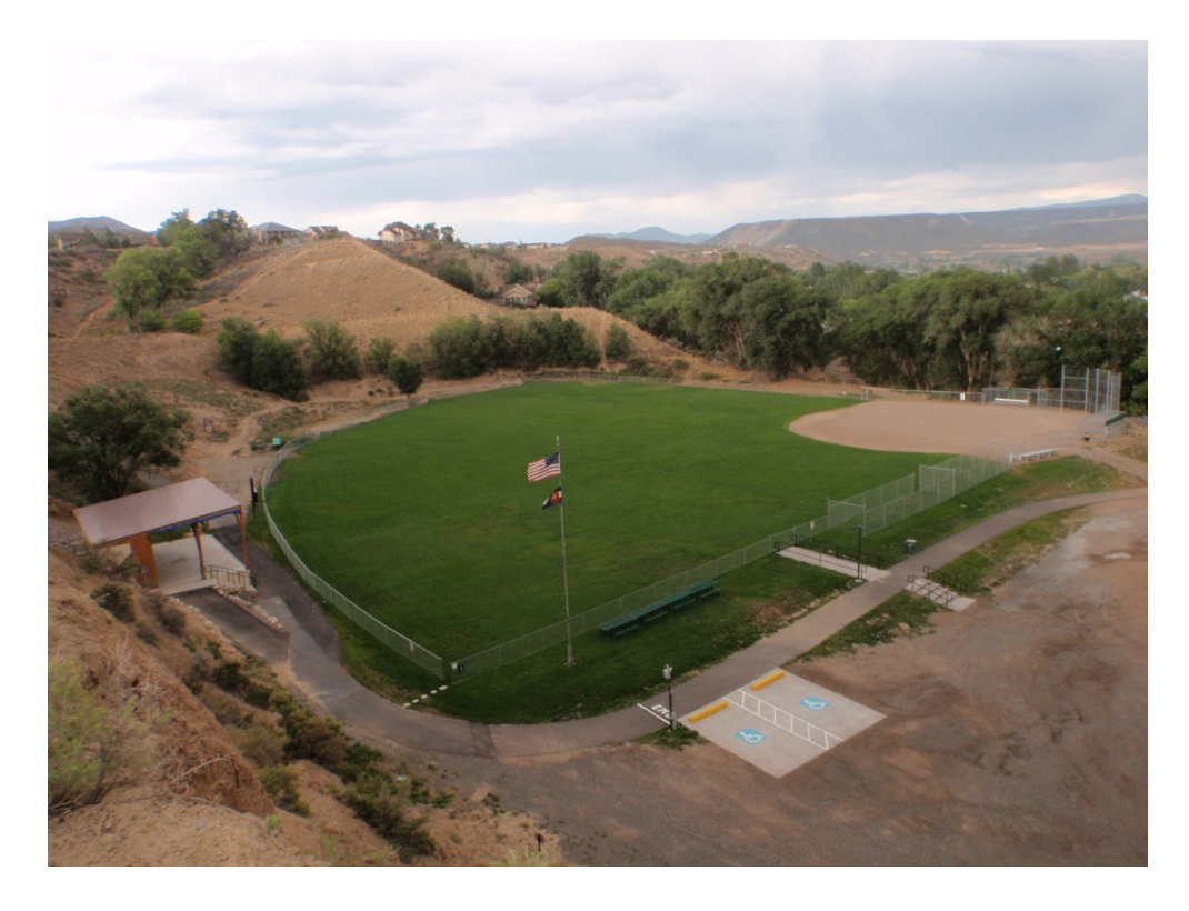
Stoney Ridge Ball Field/Pavilion, including parking areas, loading/unloading zone