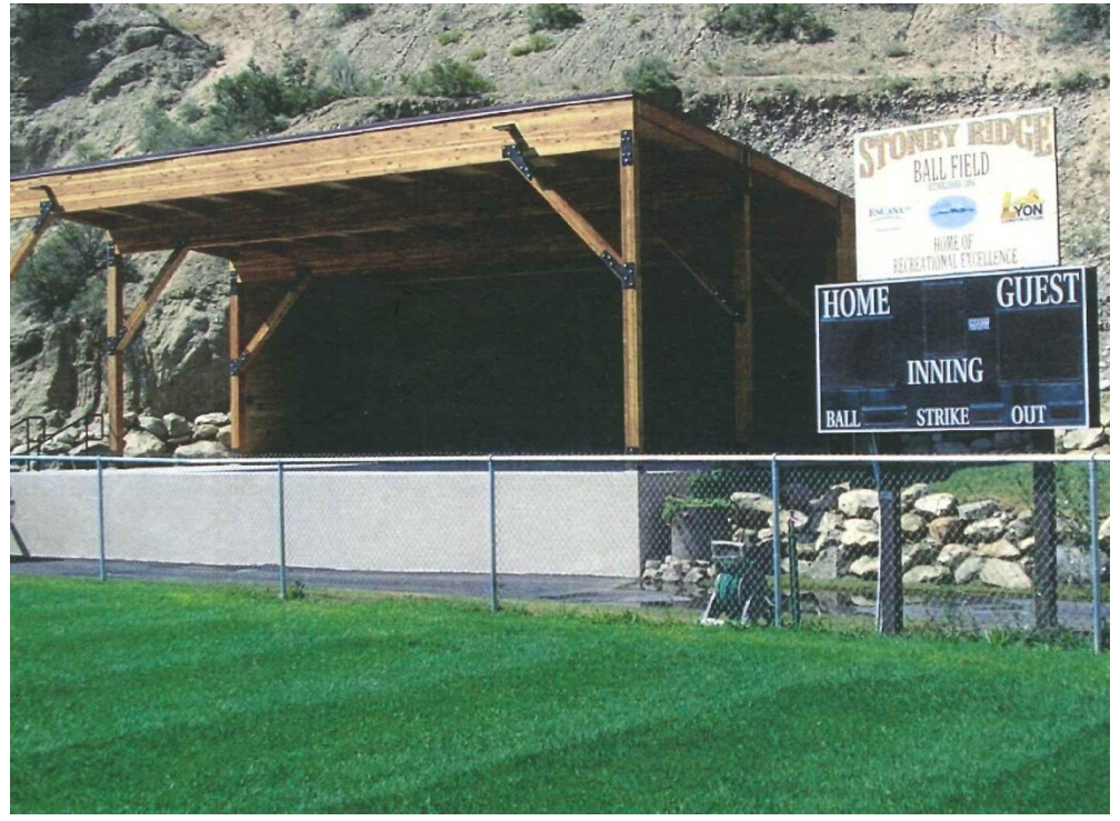
Stoney Ridge Pavilion