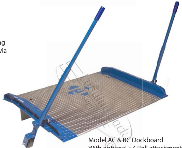
Model AC & BC Dockboard With optional EZ-Roll attachment