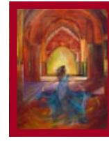
"Dance Your Dreams"