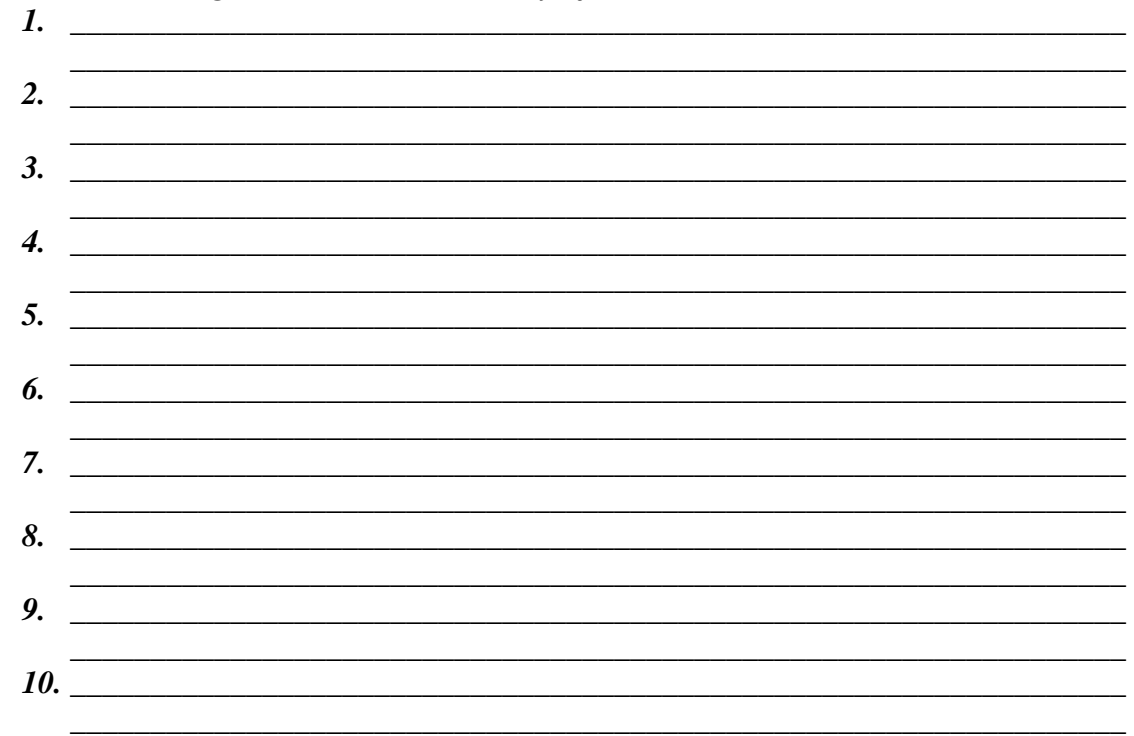
Here are the changes I desire to make in my life and me at this time:

We are at the point in the design process for potential change where it is important for you to pull together <u>all</u> the ingredients from time, energy, and cost to complete your desired change process design. This is <u>your</u> design for change, so determine <u>now</u> what you want to change, if anything, and what you want to leave alone or alone for now.