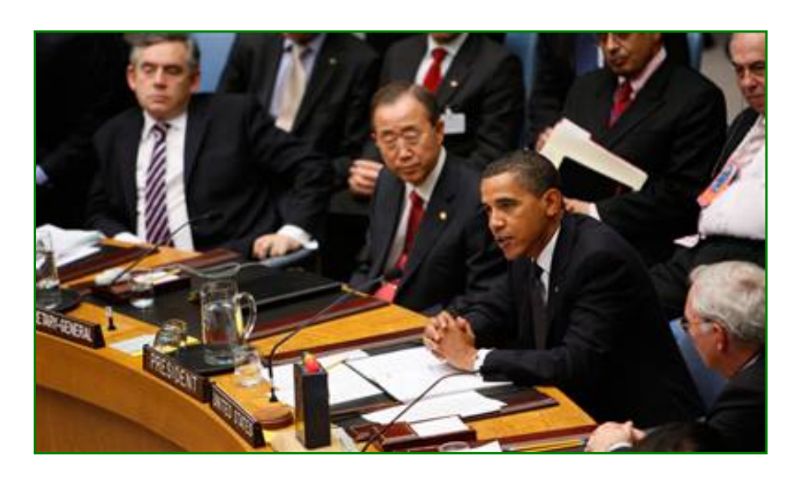
Continue To Pray

Bringing our President and our nation before Almighty God is the very best thing we can do to support our nation and its leaders. Seeking to uphold our leaders and those they lead, patriotic Americans have found prayer to be the surest way to bring positive change to our world. Together we are fighting the spiritual battle that threatens our religious freedoms and our personal well-being. Politics, events and popular culture can change and even alter the very fabric of our nation. But God does not change. When we appeal to Him in prayer, He hears us and answers our prayers in accordance with His perfect will. He hears and answers the prayers of His people for our country.