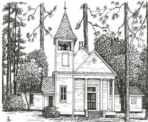
Swift Presbyterian Church