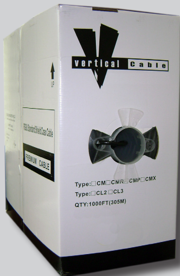
Dimensions 21H x 21L x 9W (inches) (Packaging may vary)