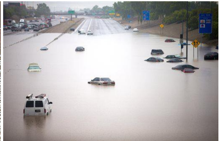
Record-Breaking Rainfall in Phoenix, AZ – Monday, September 8 th , 2014

The road in the wilderness that the Lord has commissioned the remnant Church in Arizona to build is the Highway of Holiness. The Highway of Holiness will be prepared by the remnant Church, but made straight by a new company of prophets coming in the spirit of Elijah. These prophets will not only preach a message of repentance, but also possess a mantle of repentance that will prepare a people for the coming of the King of Glory. These prophets will be messengers of fire and be accompanied by a spirit of judgment and burning that will purge and purify a remnant wholly given over to the Lord. (Malachi 3:1-3, Isaiah 4:3-6, Psalm 24:3-10).