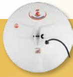
18-inch Monoloop (P/N 3011-0075)

Find more gold of all sizes and at all depths with a specialist Commander accessory coil.