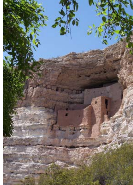
Montezuma Castle National Monument

The stone ruins here are very different from the cliff dwellings found at Montezuma Castle and Well. Tuzigoot is the remains of a 110-