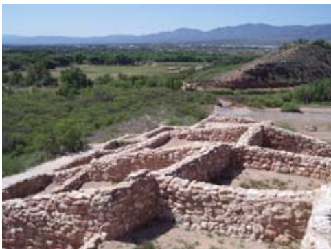
Tuzigoot National Monument

and Montezuma was never there (early explorers and settlers mistakenly thought the Aztecs had built it), the five-story cliff dwelling is certainly majestic. Perched 100 feet above the valley floor, the 20-room fortress is still 90 percent intact, and one of the finest cliff dwellings in the country. Although visitors are no longer permitted to go up into the ruins, Montezuma Castle is easily observed from the park's paved 1/3-mile loop trail, which also meanders through a sycamore grove and along Beaver Creek, one of only a few year-round streams in the state. Interpretive signs along the walkway describe the Southern Sinaguan way of life. Also spend some time inside the visitor center at Montezuma Castle. Beautiful pottery and textiles are displayed, along with other artifacts. Listen in on a ranger program, or join a group walk to learn even more.