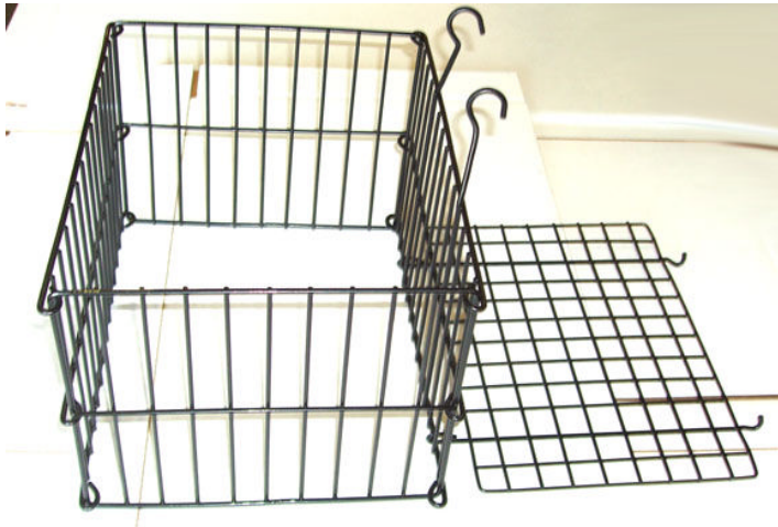
STEP 3 – POP SIDES OF SPORTSBASKET UP