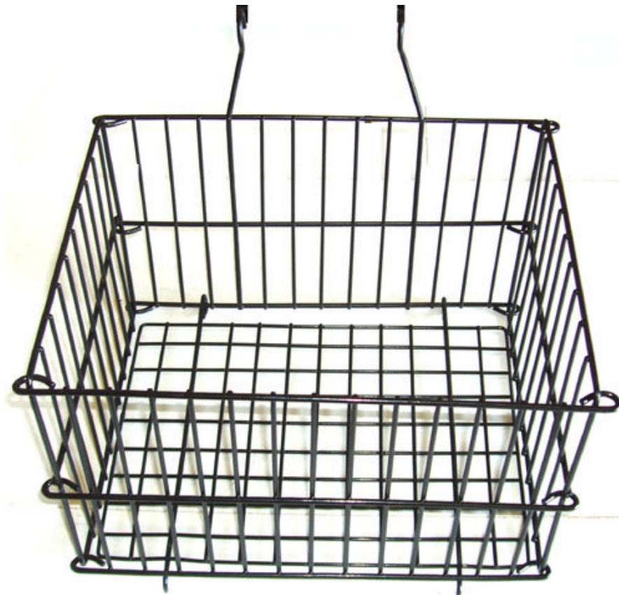
STEP 4 – SWING BOTTOM AROUND AND HOOK OVER