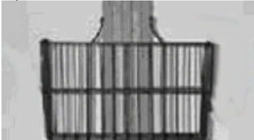
Sports Basket on OAK Rack