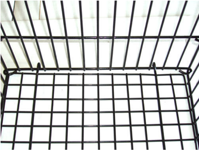
CLOSE UP OF BOTTOM HOOKING OVER SIDE