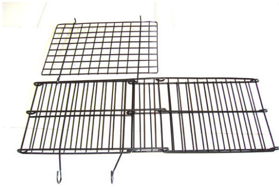
STEP 2 – FOLD BOTTOM UP AS SHOWN IN DIAGRAM