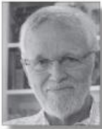
CLYDE EDGERTON Author of novels, short stories, memoirs, and essays – some of which have been New York Times Notable Books.