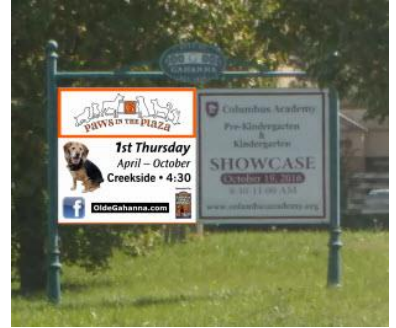
Sponsor at the Banner Breed or Party Pooch level and we'll include you on the community Gateway Posters throughout the city.