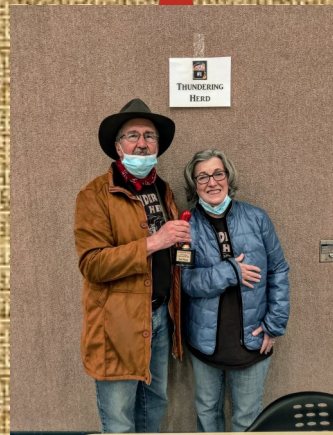
2 nd Place Winners