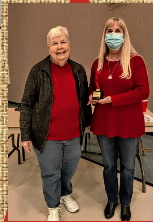
3 rd Place Winners