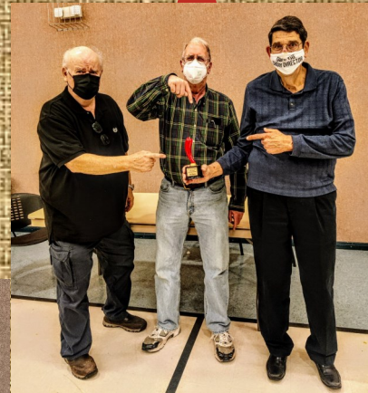
1 st Place Winners