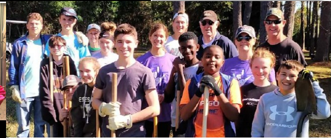
Youth Tree Planting Point Aquarius