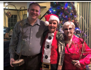
Choir Christmas Party