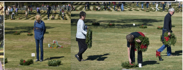
Wreathes Across America