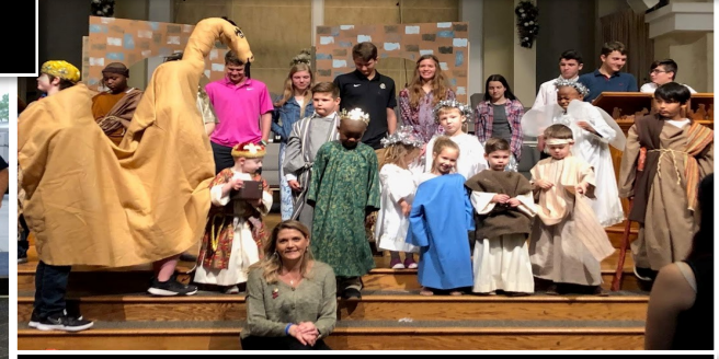
The Christmas Pageant