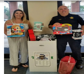
Operation Blue Elf