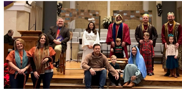
The Christmas Story